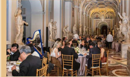
Black tie gala dinner inside the Vatican Museum