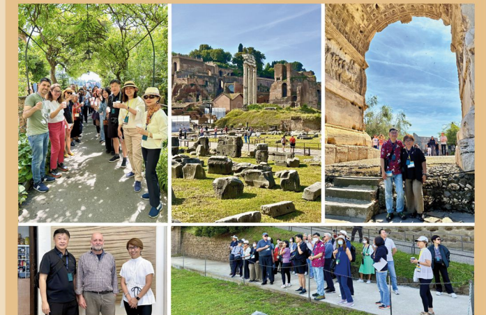
An exclusive visit to the Roman Forum and visit to a private art studio at the Palatine Hills