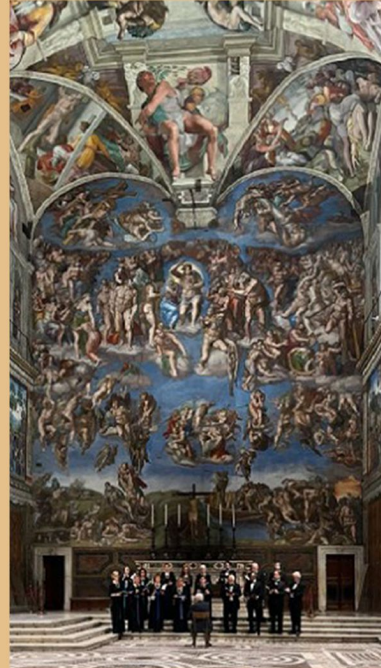
Private tour of the Sistine Chapel with choir ensemble entertainment