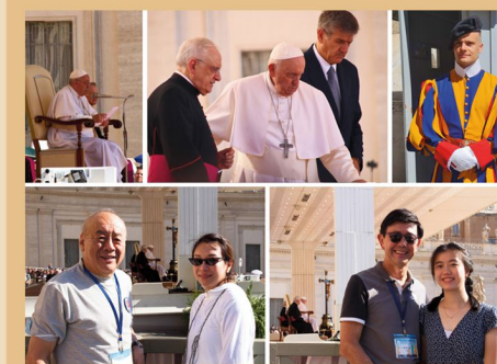
VIP seating at Pope Francis Papal Audience